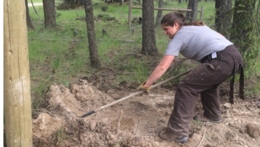
Fence repair in the Kootenays