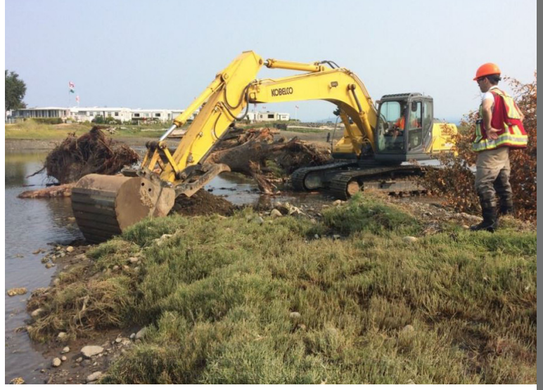
Work begins to remove an old roadway

Since the 1930s, the Englishman estuary has been impacted by dikes, roads, residential development, industrial uses, and ditching. The first step of this 5-year restoration project was to remove an old abandoned roadway on the west side of the estuary that was originally constructed in the 1960s for log booming operations. Other activities include enhancing tidal channels, increasing habitat complexity for fish and wildlife, and removing invasive plants. Funding for this project is provided by Canada's National Wetland Conservation Fund and the Habitat Conservation Trust Foundation.