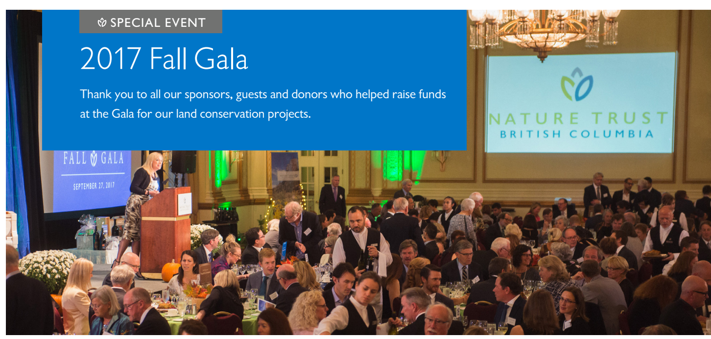
Gala guests with MC Tess van Straaten from CHEK TV