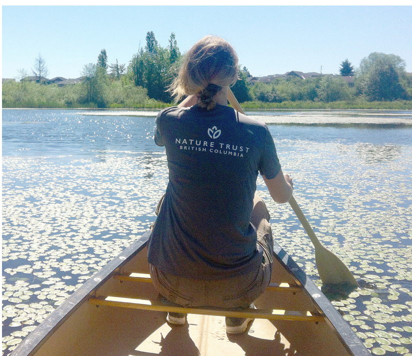
Wildlife monitoring at Buttertubs Marsh on Vancouver Island