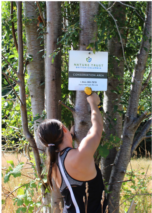
Conservation Youth Crew member installing sign