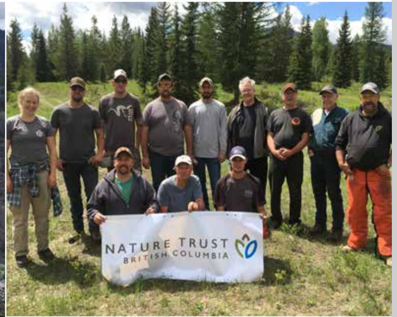
Elkford Rod & Gun Club at Nature Trust Big Ranch in Kootenays