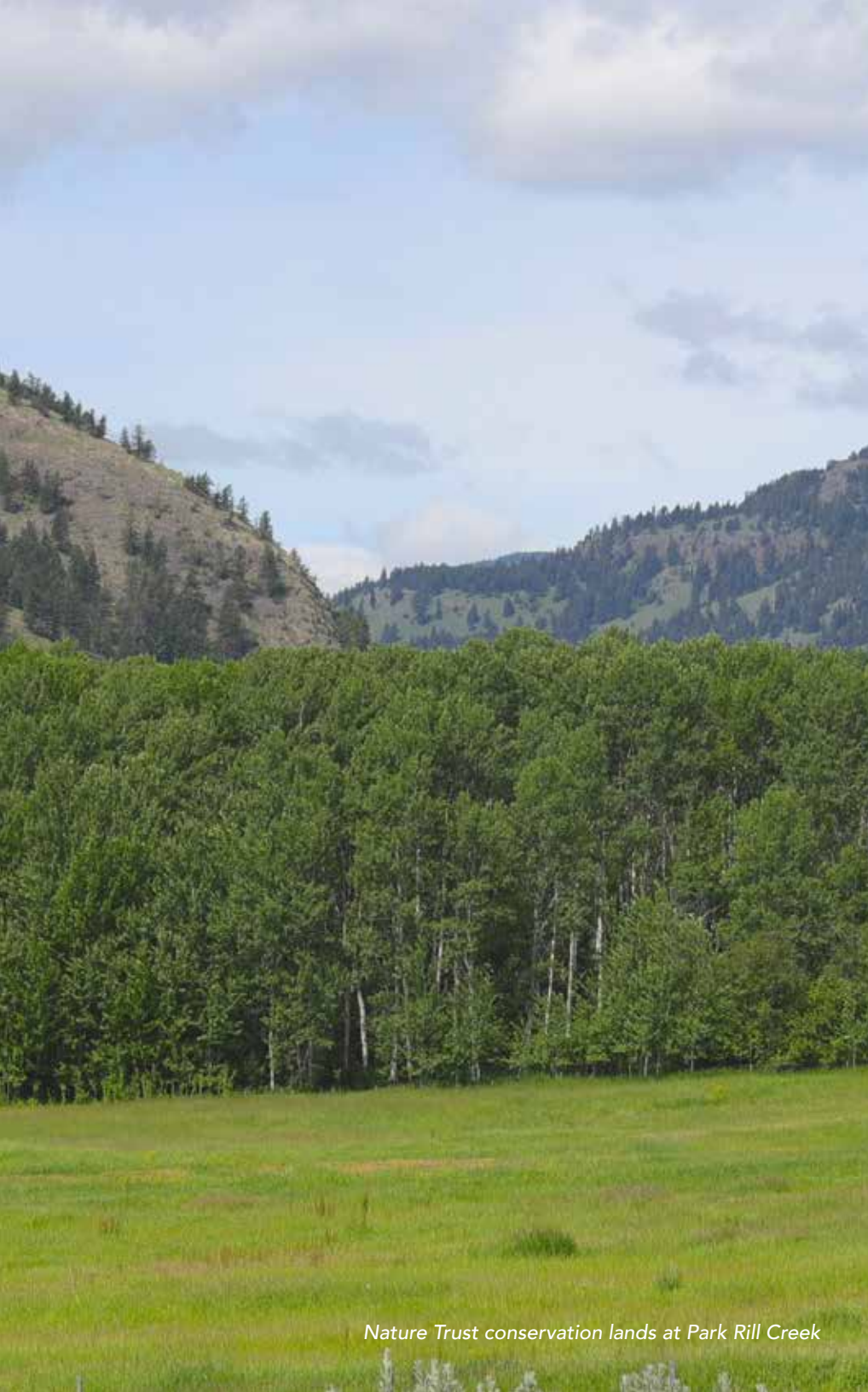
Nature Trust conservation lands at Park Rill Creek

The challenge is significant but so are the stakes. BC has the most biological diversity of any province in Canada. Many of these species are at risk of disappearing. This loss of biodiversity has uncalculated consequences for future generations. This is why our Board and staff have made a commitment to accelerate the rate at which we are protecting ecologically significant land and to increase our resources.