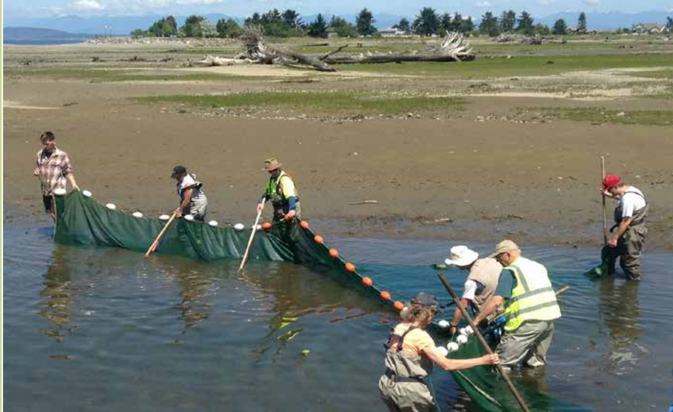
Mid Vancouver Island Habitat Enhancement Society collected data on fish species

This project is coordinated by the West Coast Conservation Land Management Program on behalf of The Nature Trust of BC, and involves several partners including Fisheries and Oceans Canada, Ministry of Forests, Lands, Natural Resource Operations and Rural Development, BC Conservation Foundation, Mid Vancouver Island Habitat Enhancement Society, the Arrowsmith Naturalists, and Guardians of Mid-Island Estuaries Society.