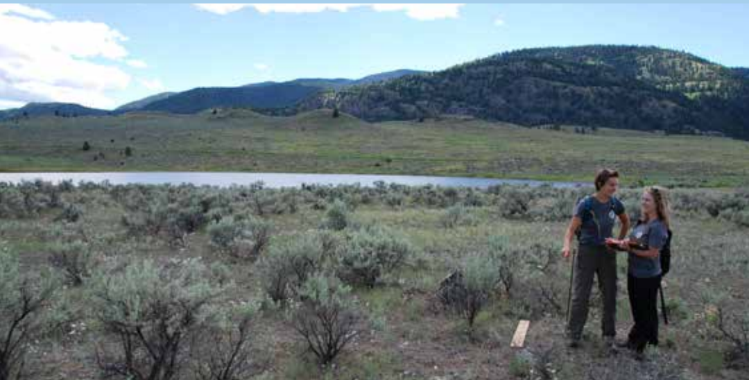
Okanagan crew setting up photo monitoring