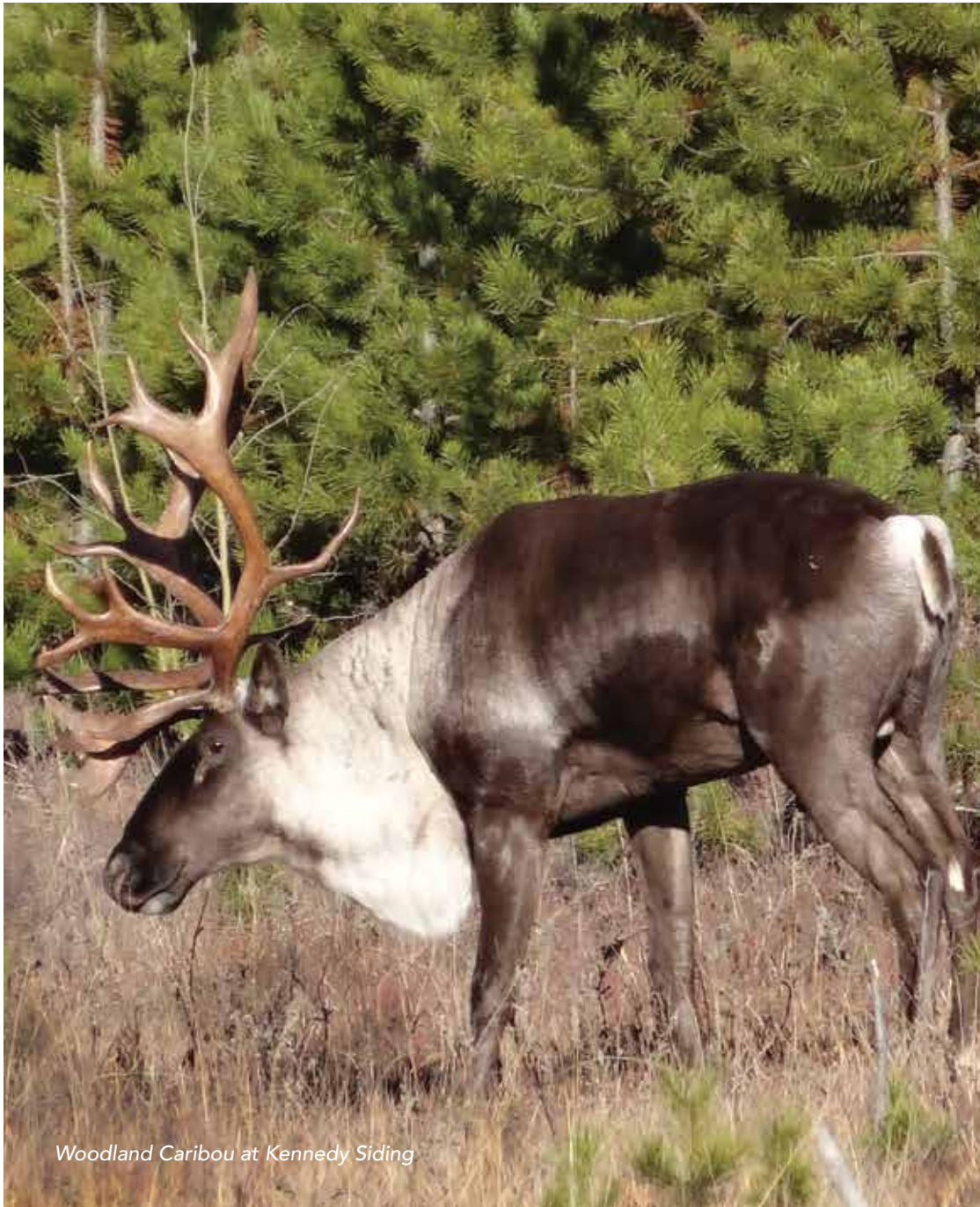
Woodland Caribou at Kennedy Siding