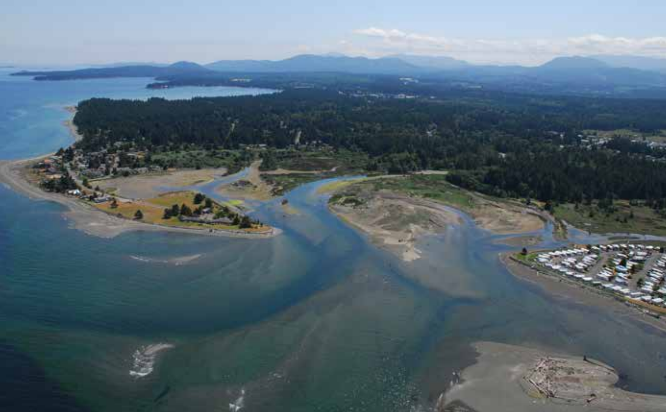
Aerial view of Englishman River estuary on Vancouver Island