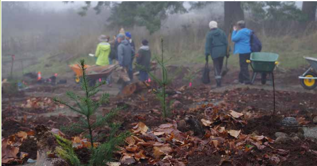
Arrowsmith Naturalists planted trees and removed invasive plants