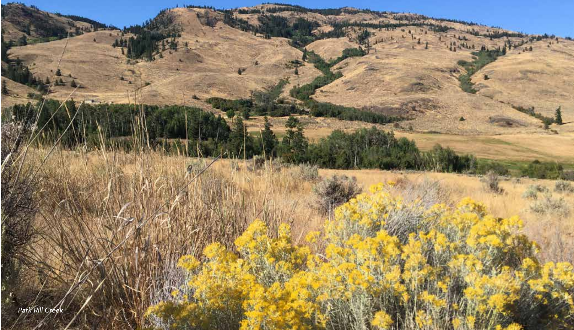
Park Rill Creek