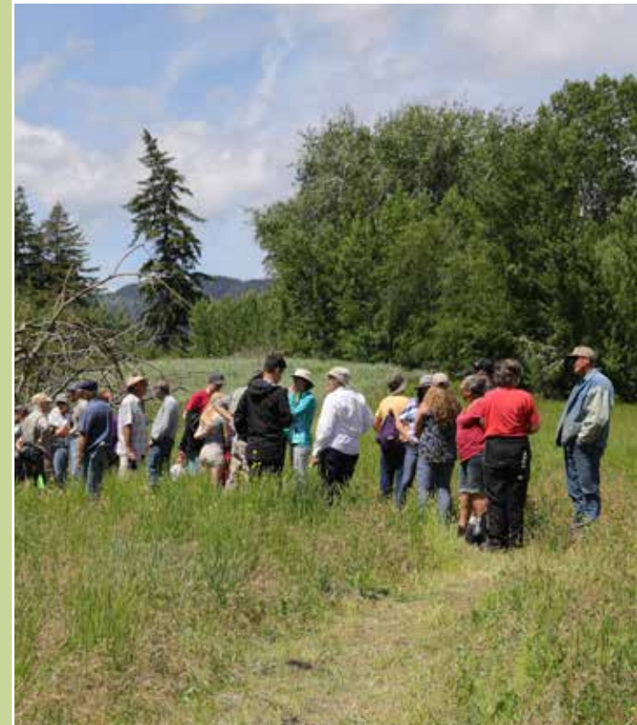
Tour of Nature Trust conservation lands at Park Rill Creek