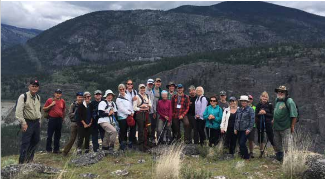
Meadowlark Festival in Okanagan