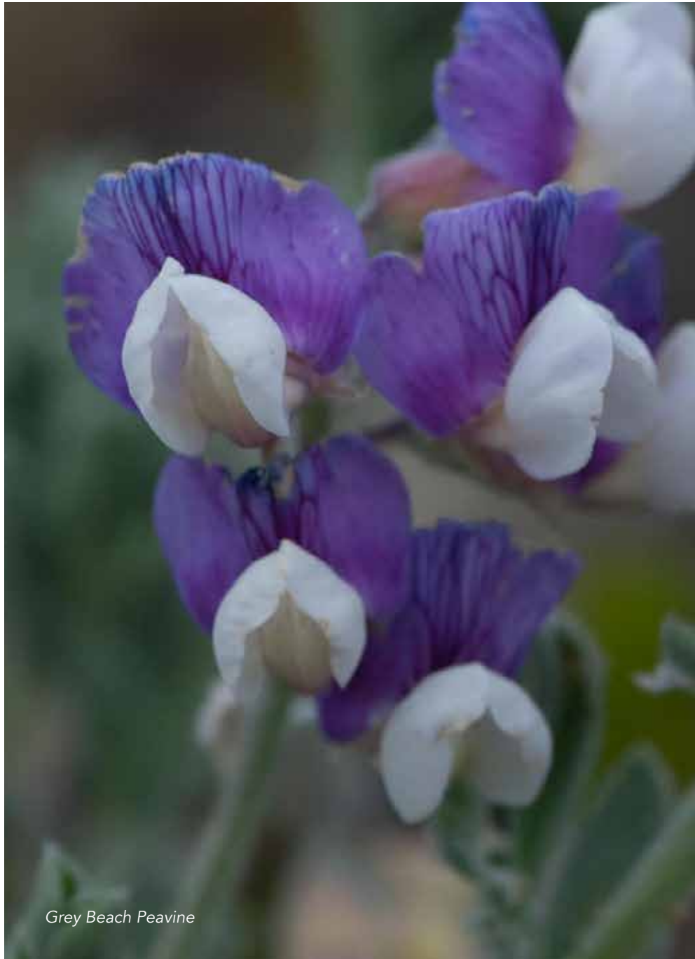
Grey Beach Peavine