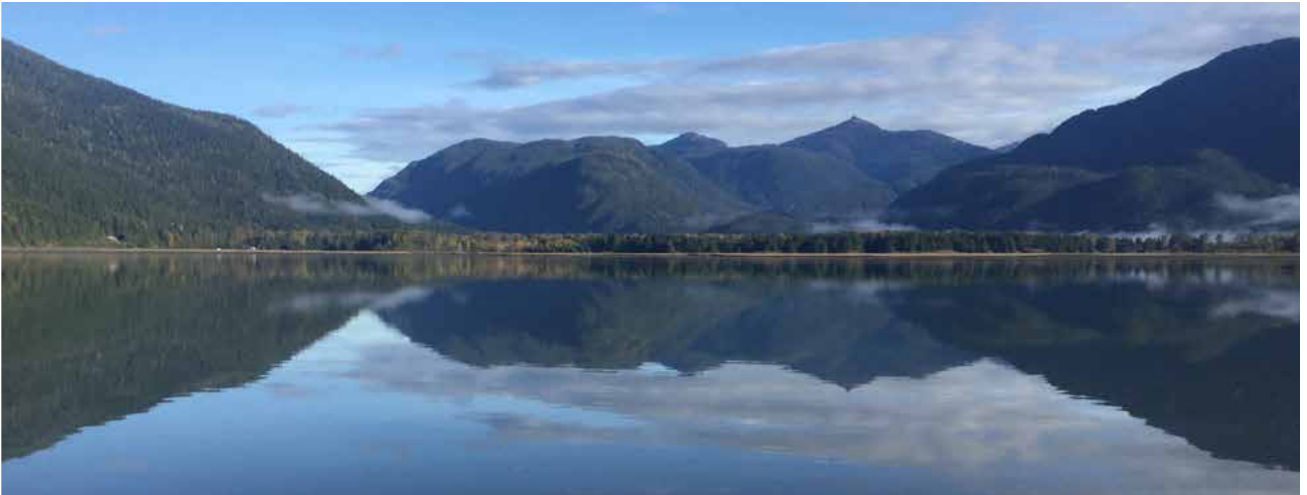
Nature Trust conservation lands at Alice Arm Estuary