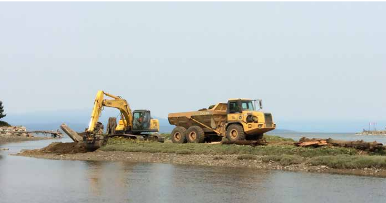
Heavy equipment removed the dike which restored the water flow