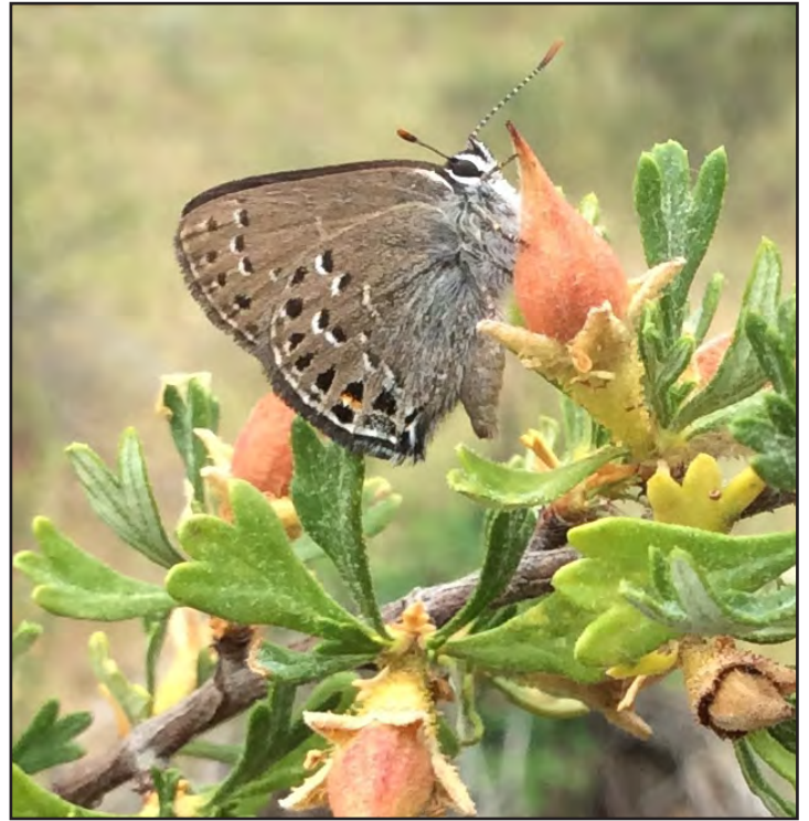
Behr's Hairstreak butterfly