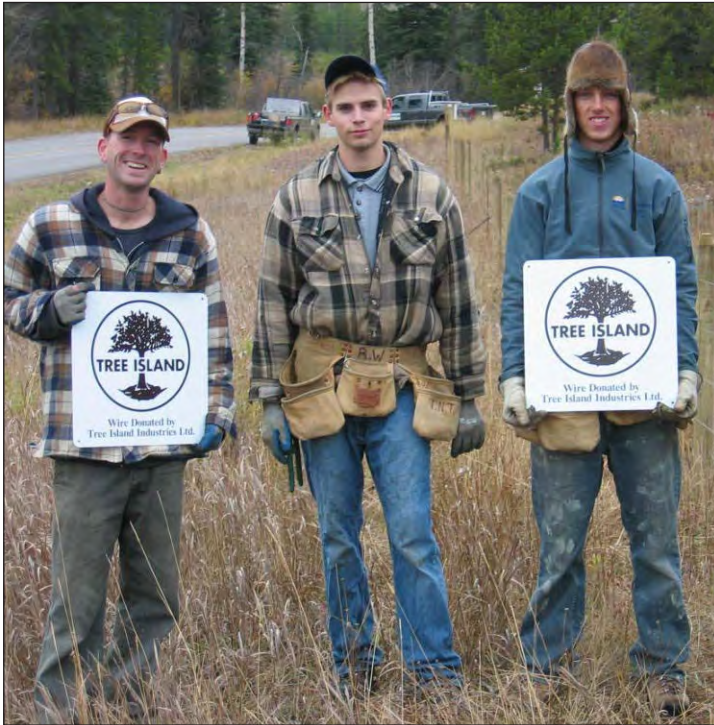
Kootenay Conservation Youth Crew installing fences using Tree Island wire