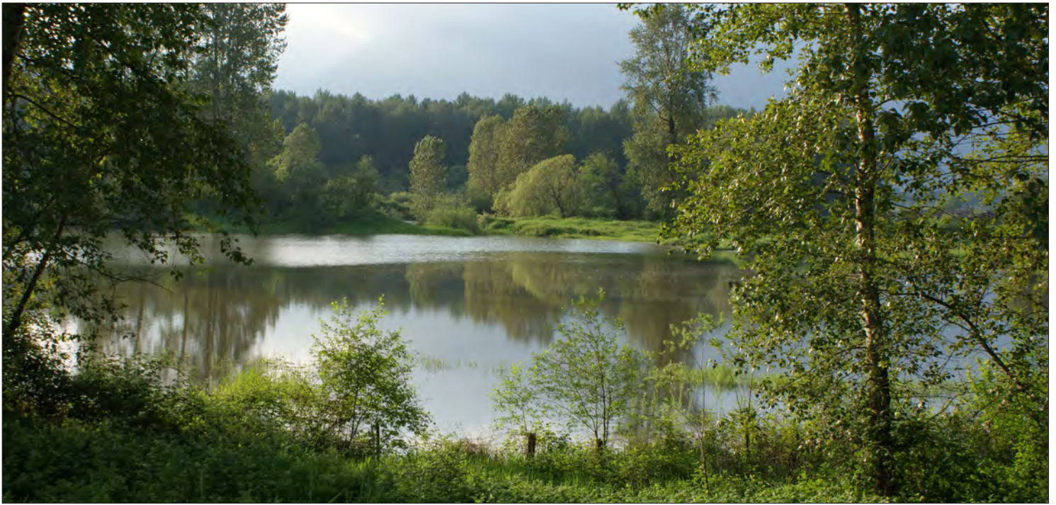
The Nature Trust's McGillivray Slough property in the Lower Mainland