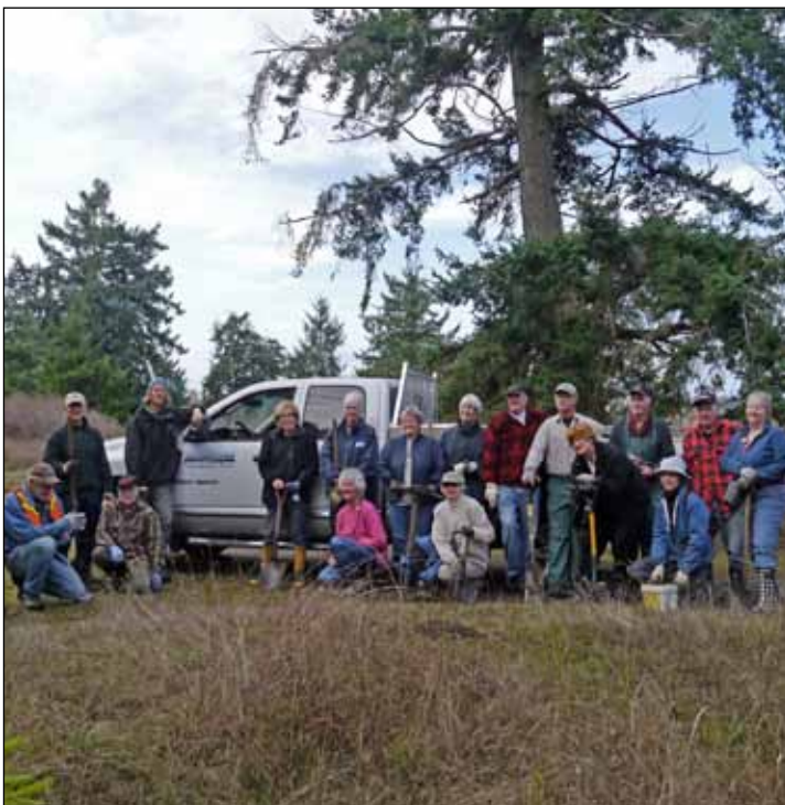
Arrowsmith Naturalists ready to plant trees