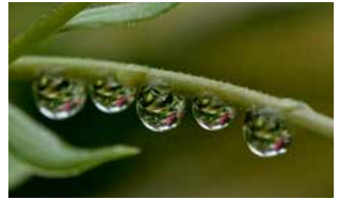
Plants & Water Winner, Jack Pickell