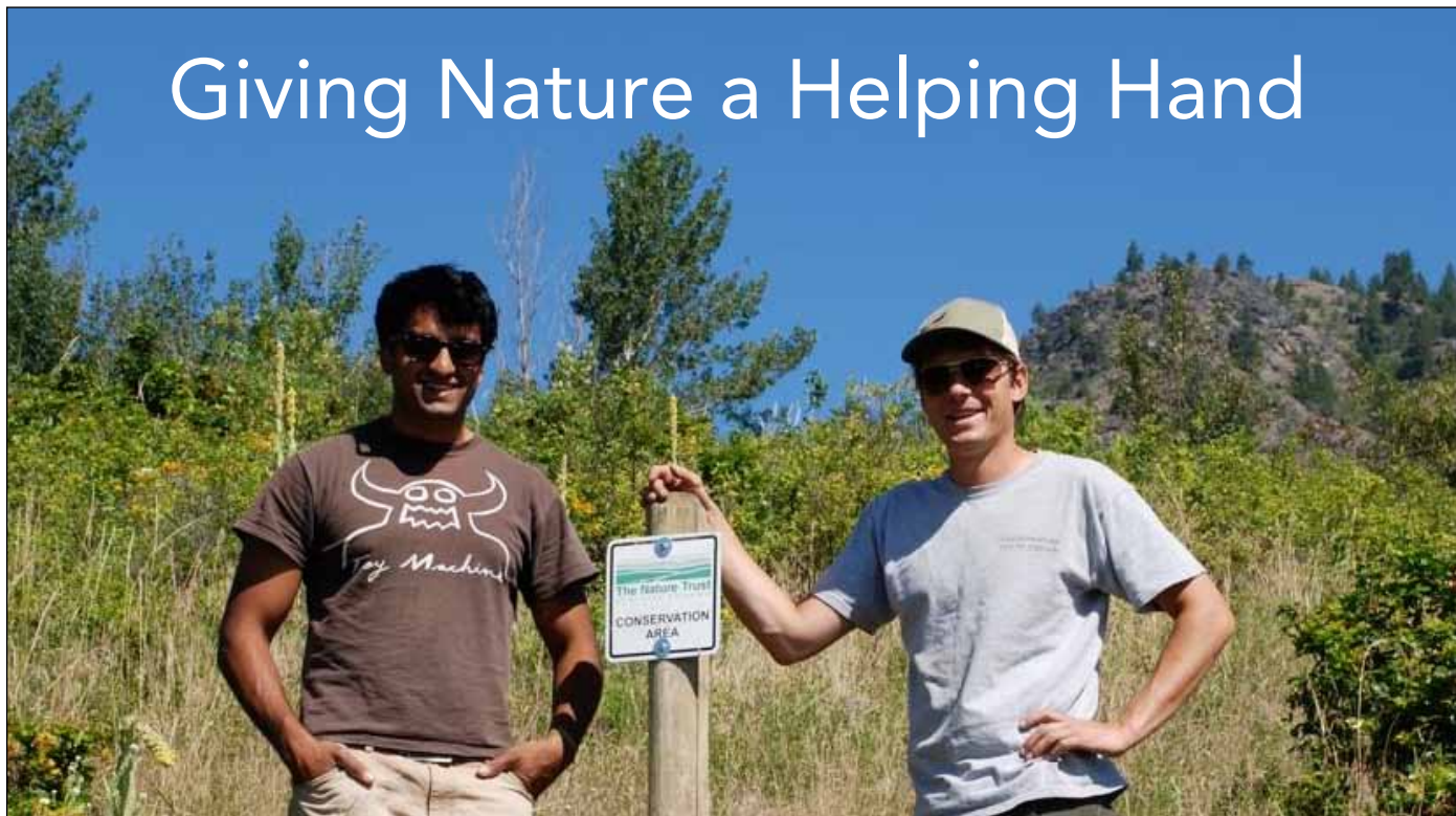
Okanagan crew installing sign

The Nature Trust of BC works with donors and partners to acquire land across British Columbia for conservation purposes. We also manage these properties.