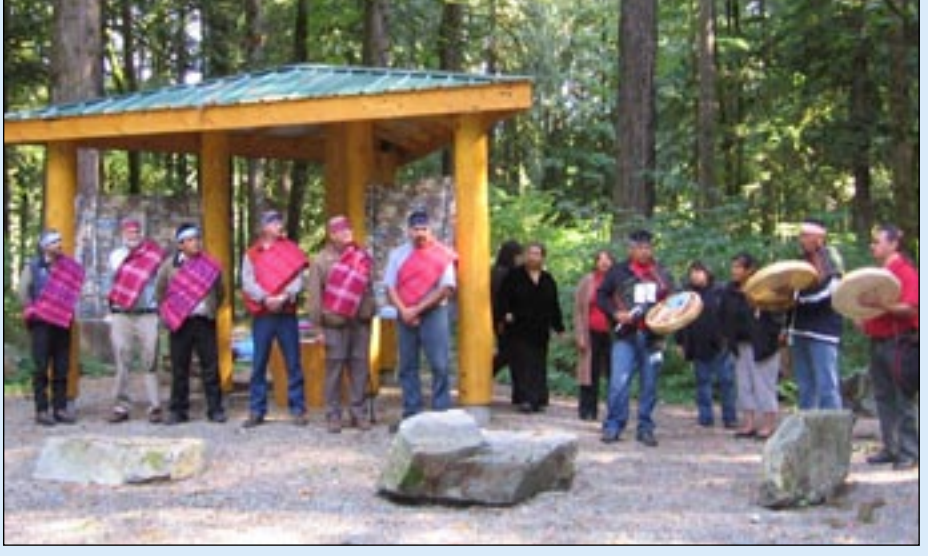
The Chehalis River Fishing Trail sign was unveiled with local partners