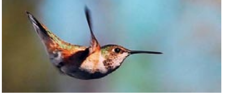
"All Living Things" by Daphne Eze