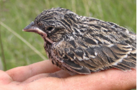
Vesper Sparrows