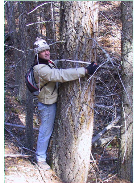
Data collection at Rock Creek, South Okanagan

This team is a joint initiative of the Ministry of Environment and The Nature Trust. The team will provide rigorous training and field experience for four candidates recruited under the BC Conservation Corps program under the supervision of The Nature Trust's Ecosystem Specialist and regional Conservation Land Managers. Team members will be encouraged to apply for potential employment opportunities with the BC Ministry of Environment, Canadian Wildlife Service or Fisheries and Oceans Canada after the season is completed.