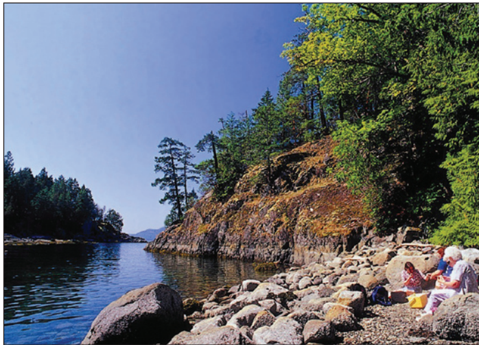
Francis Point, Sunshine Coast

us to enjoy for years to come. Making your most substantial gifts to charity through your will is popular because you know that you will not need your worldly goods any more, and the donation receipt will coincide with the increased burden of the deferred income taxes triggered by death on RRSP's, RRIF's, recreational property and investment portfolios. For couples, the donation can be timed in the will to coincide with the death of the surviving spouse so that the surviving spouse has all assets available for his or her support, and the donation tax credit becomes available when the majority of the taxes are due, after the death of the surviving spouse.