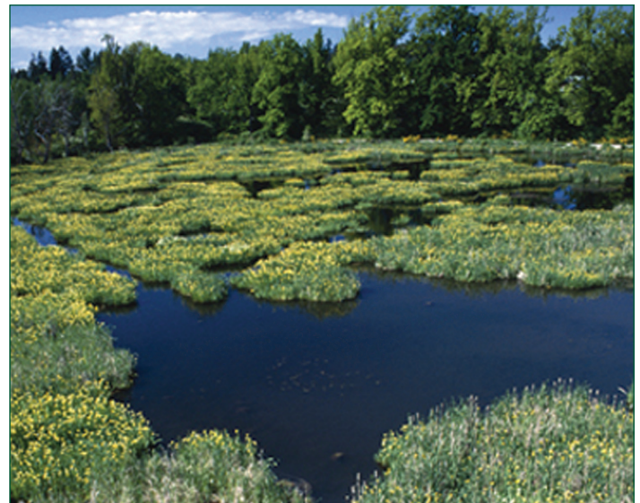
Buttertubs Marsh, Vancouver Island

Buttertubs Marsh, with a total area of approximately 40 hectares (100 acres), is the last large area of undeveloped land within a few kilometres of downtown. This wetland and floodplain wildlife habitat includes more than one kilometre of the Millstone River. Birds found in the marsh include Wood Ducks, Barred Owls, Red-winged Blackbirds, Marsh Wrens, Virginia Rails, Common Yellowthroats, and Willow Flycatchers. Several amphibian species as well as beavers, deer, muskrats, mink and river otters use the area.