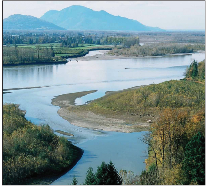
Gravel Reach, Fraser River.

If you wish to be known by what you give rather than what you get in this life, then philanthropy is already part of your daily life. However, if you are not in a position during your lifetime to make a substantial donation, because you are afraid of outliving your wealth, then making a gift to charity in your will is a very unselfish way to give back to the people and the world around you some part of the life you enjoyed.