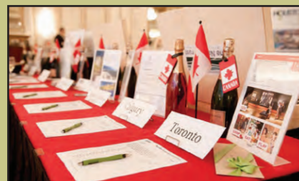
Silent Auction Tables