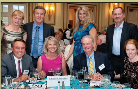
Sitka Foundation table