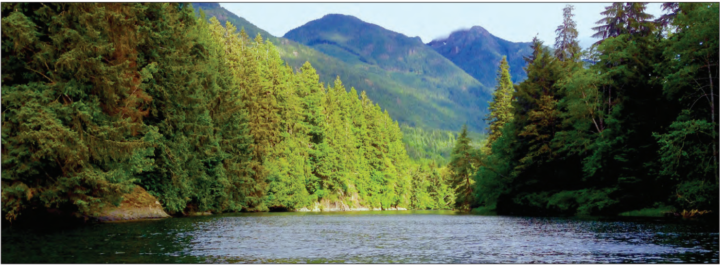
The Nature Trust of BC's new Salmon River property