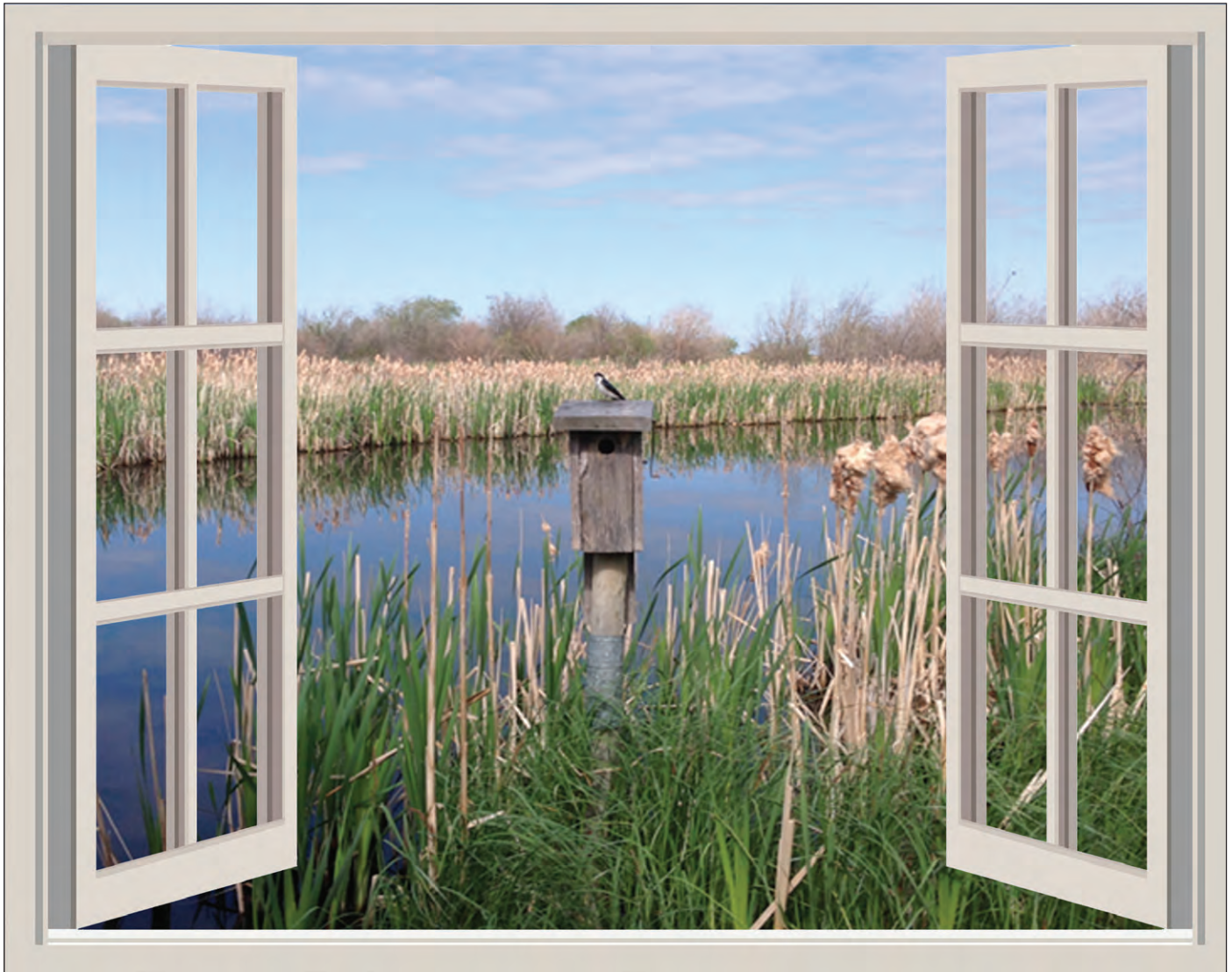
The Nature Trust of BC's McQueen Slough property