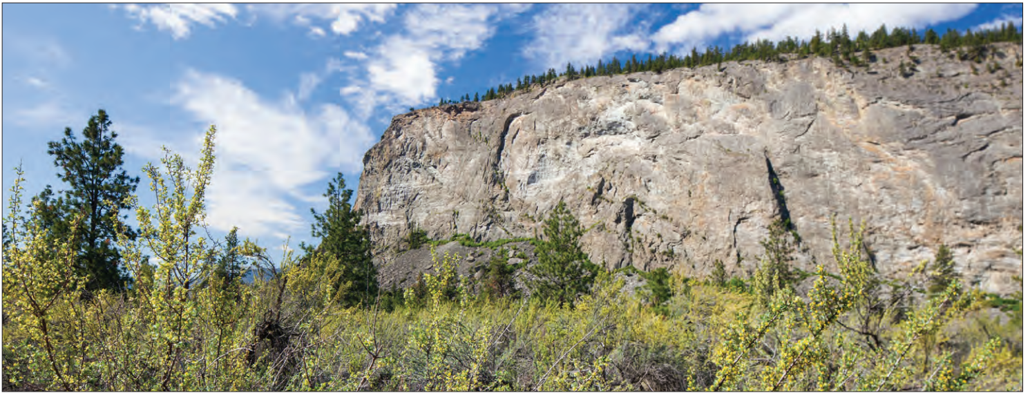
The Nature Trust of BC's Antelope-brush Conservation Area