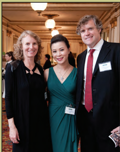
Nature Trust staff welcome guests

Thank you to all our sponsors, guests and donors who helped raise funds at the Gala on Oct. 6 for our land conservation projects