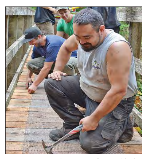
Volunteers on Willow Creek bridge.

If you would like to donate for a land management endowment for this special property, please call 604-924-9771 (toll free 1-866-288-7878) or visit our website www.naturetrust.bc.ca