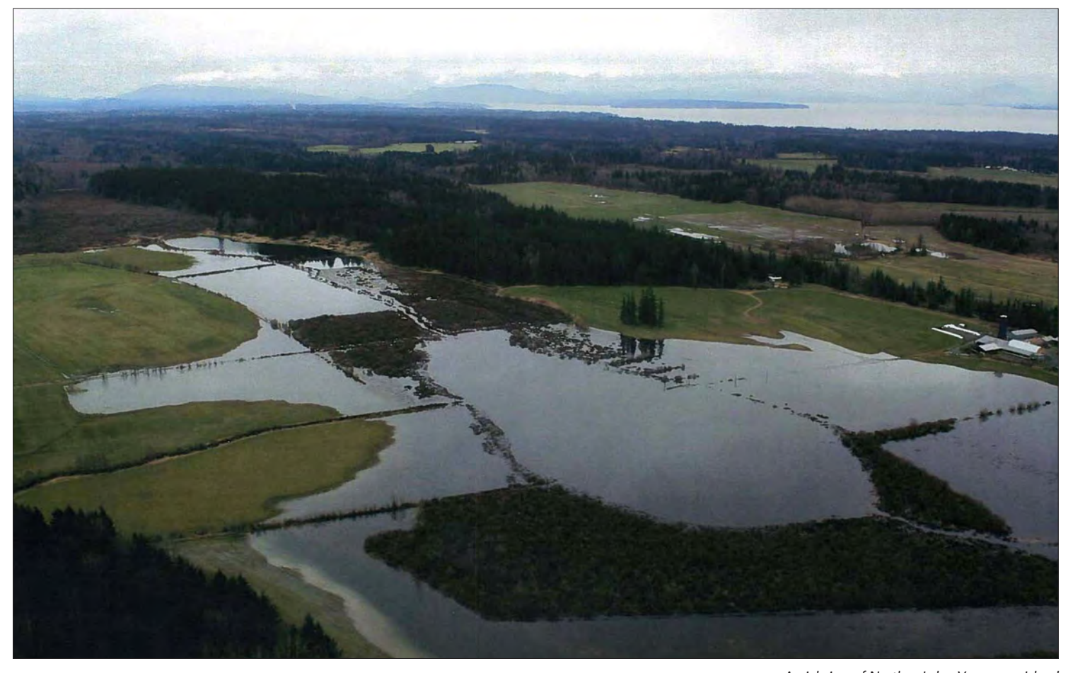
Aerial view of Northey Lake, Vancouver Island