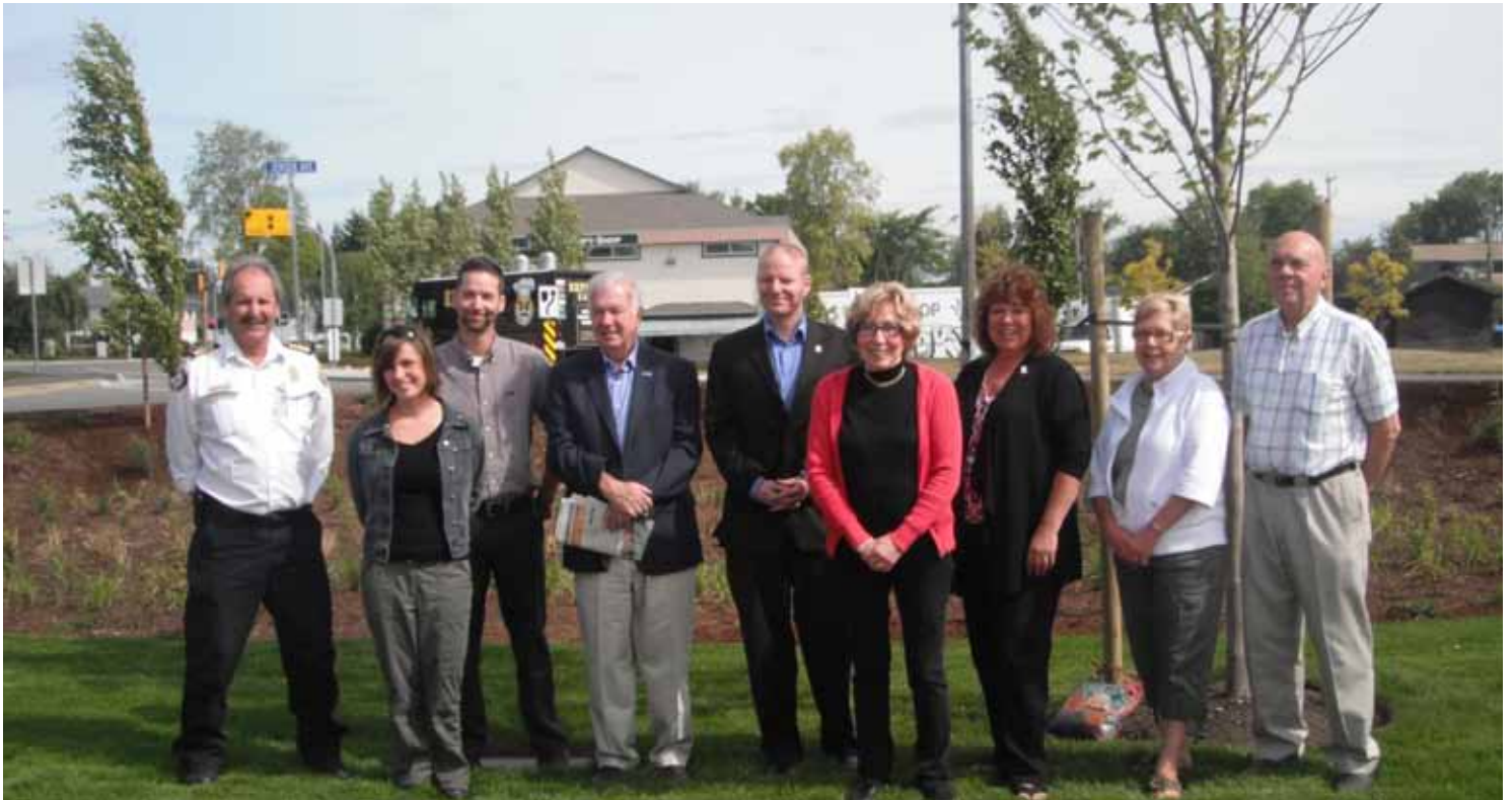
Celebrating the new Parksville Rain Garden