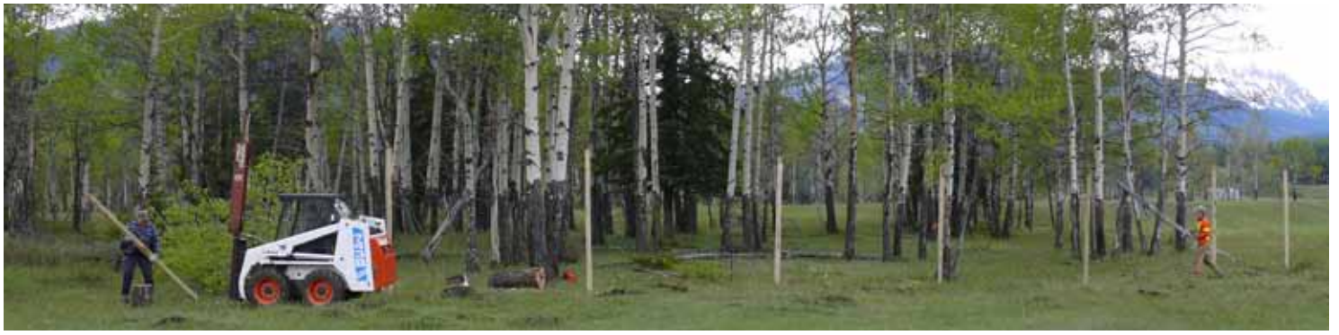
Installing fencing to protect aspen trees