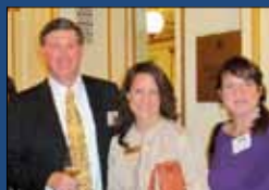
Nature & Water Annual Gala