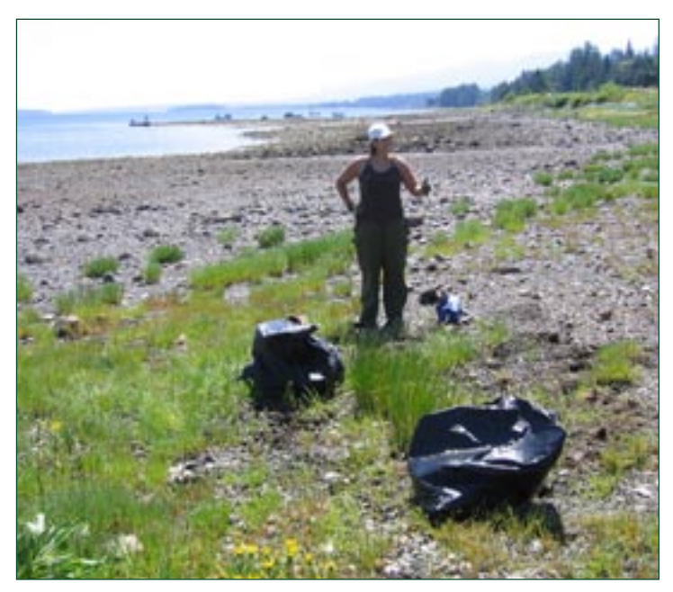
"Conservation areas are such a good thing and in order to keep areas as pristine as we can, we all need to do our part."

The Nature Trust of British Columbia hires crews each summer to tackle a wide variety of conservation activities on properties across the province and learn valuable skills for future employment. Training includes First Aid and Bear Aware as well as the safe handling of power tools. The crews perform on-theground work as well as attending workshops from specialists in the field on topics such as bird counts, and forest and wetland ecology. Crews worked on Vancouver Island, Lower Mainland,