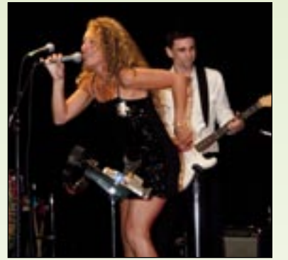
Cat Wells rocks!