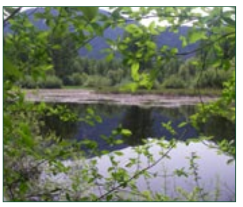
Pemberton Wetlands at Lillooet River

This property deserves our attention. It provides a range of habitat including a wetland formed by an old oxbow of the river, a year round creek, moose and deer winter range and old growth riparian forest. We need your help to raise $145,000 to complete this acquisition and to cover stewardship and land management.