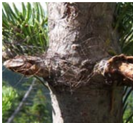
Bear hair in a tree