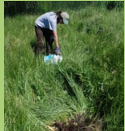
Tree planting in the Okanagan