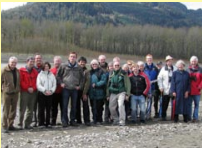
The McGillivray Slough wetlands complex near Chilliwack was renamed the Bert Brink Wildlife Management Area this spring