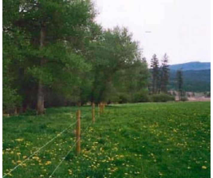
McLean Creek Ranch

Due to extensive human development, only 10% of the historic riparian habitat remains in the South Okanagan, so it is critical that we protect and restore as much as possible. Over the course of this project, over 50 kilometres of fencing have been installed at 45 project sites throughout the South Okanagan Similkameen. This has resulted in the protection of over 385 hectares of habitat, benefiting a broad range of riparian species, including Yellow-breasted chat, Western Screech-owl, Tiger salamander, and Great Basin Spadefoot Toad. An annual program of bird and vegetation monitoring is in place to measure progress over time on past project sites.