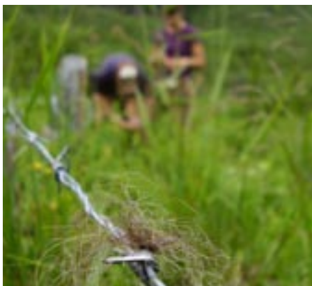
Bear hair on a wire

The involvement of the crews from 2007 to 2009 has provided invaluable job experience, particularly for those who are interested in pursuing a career in wildlife biology. Working closely in the back country with Ministry of Environment staff has created a unique environment where crew members have had an opportunity to ask questions and seek career advice from government staff. The work has proved to be a lot of fun as well. Many crew members considered the study to be the highlight of their work experience.