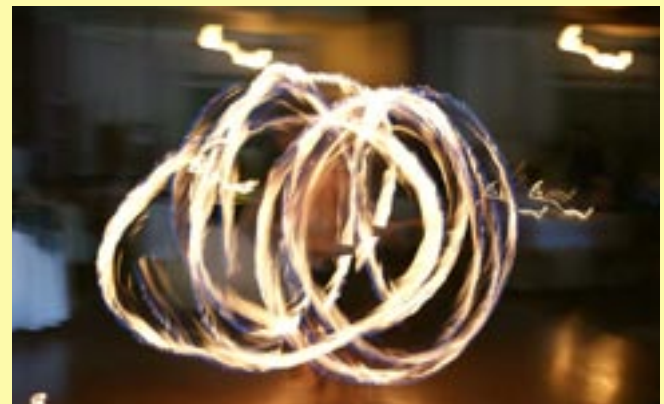
Earth Wind Fire in Kelowna was presented by the Delta Grand Okanagan Resort