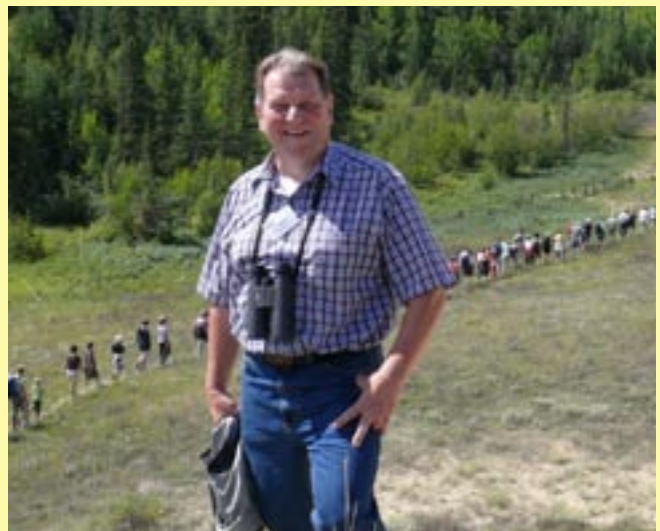
The Hoodoos Wetlands Hike was a big success thanks to everyone who participated, the hike leaders and the Shaunessys for hosting the picnic lunch in their barn.