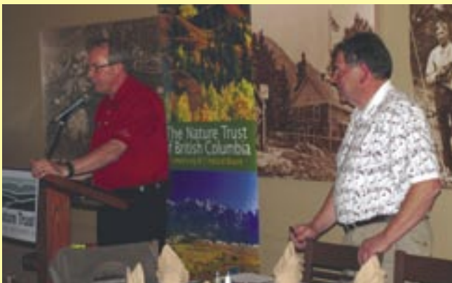
The first Fore The Nature Trust Golf Tournament was held at Riverside Golf Course thanks to the Fairmont Hot Springs Resort