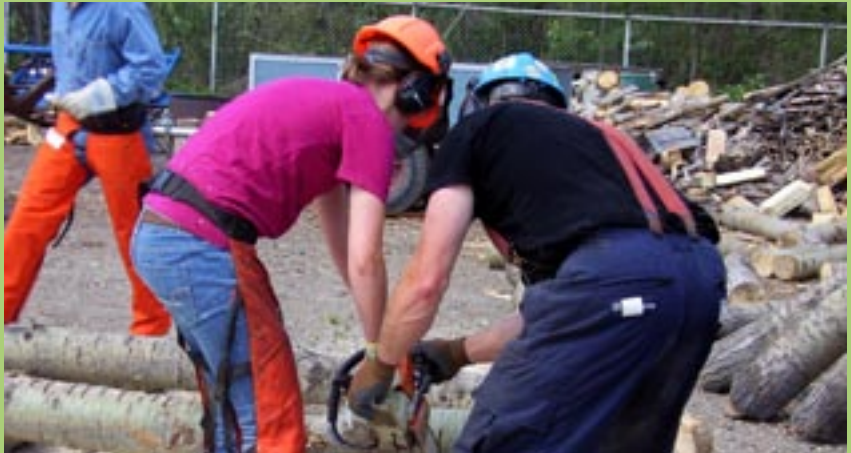
Chainsaw training in the Peace River region

In the summer of 2009 The Nature Trust operated Conservation Youth Crews in the East Kootenay, Peace River, South Okanagan, Vancouver Island and Lower Mainland. Title sponsor of the crews was HSBC Bank Canada. Other sponsors included BC Conservation Corps, BC Conservation Foundation, BC Hydro, BC Ministry of Environment, BC Trust for Public Lands, Canadian Wildlife Service, Ducks Unlimited Canada, Fish & Wildlife Compensation Program—Columbia Basin, Habitat Conservation Trust Foundation, HRSDC, Talisman Energy and The Tony Cartledge Fund.