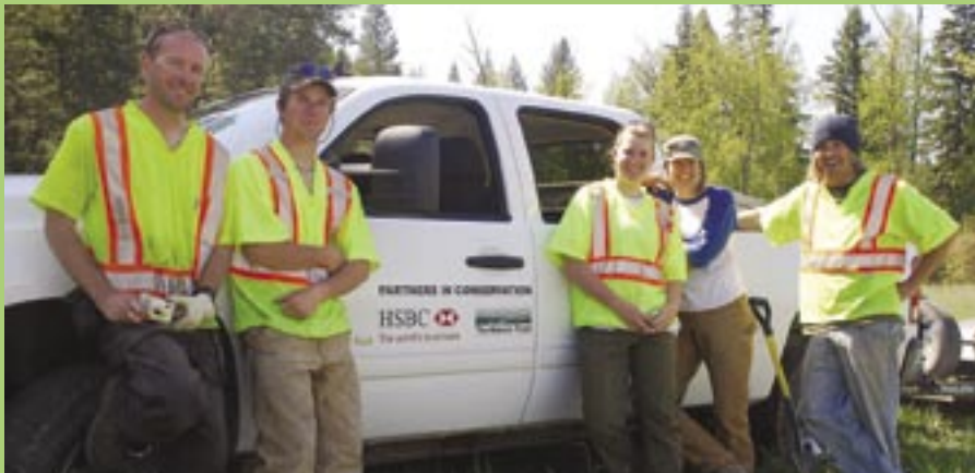
East Kootenay crew