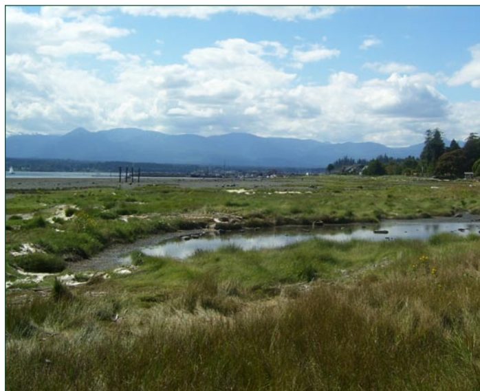
Brooklyn Creek meanders through this spectacular property

The property is adjacent to an area that is designated as a proposed park in the Official Community Plan as well as Mack Laing Park, which is owned by the Town of Comox. This acquisition provides an opportunity to manage the larger conservation complex and supports the ecological function of Brooklyn Creek as a corridor for fish and other wildlife.