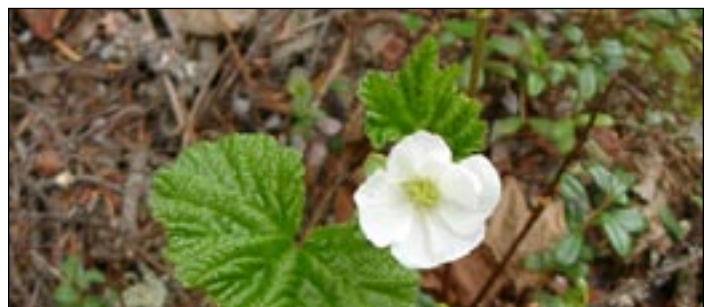
Black-capped chickadee; Cloud Berry at Smith Bog